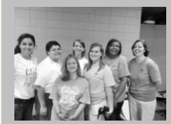
RELAY FOR LIFE