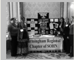
SAN FRANCISCO 2011

www.birminghamregionalchapterofsohn.org www.2012headandneckconference.eventbrite.com