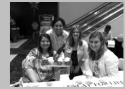
NURSES DAY MAY 2011